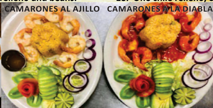
CAMARONES AL AJILLO CAMARONES A LA DIABLA